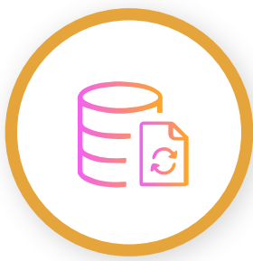
Unique Key Matching